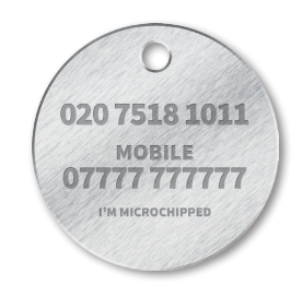
Side 2 Note: Side 2 information is optional but highly recommended by the Kennel Club Good Citizen Dog Scheme